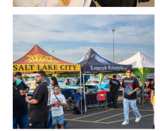
WEST VALLEY CENTER 3460 S. 5600 W.